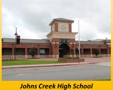
Iohns Creek High School Johns Creek, GA