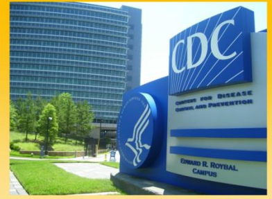
Centers for Disease Control (CDC) Atlanta, GA