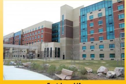
Fort Lee, VA