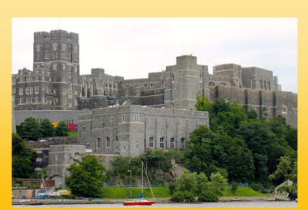
West Point Military Academy West Point, NY